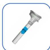
Tubes for saliva sample collection, used to study DNA.

how to grow and what job to do. A blood sample contains many different elements (DNA, RNA, proteins and metabolites involved in biochemical reactions...) which can be studied to determine if there are any hallmarks of developmental disorder. A saliva sample can be used to identify common and rare variations in the DNA sequence; by looking at the frequency of these variations in subjects with autistic traits we expect to identify which genetic signatures are involved in typical and atypical neurodevelopment.